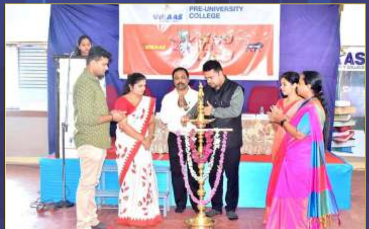
Guest at Vikaas College, Mangalore