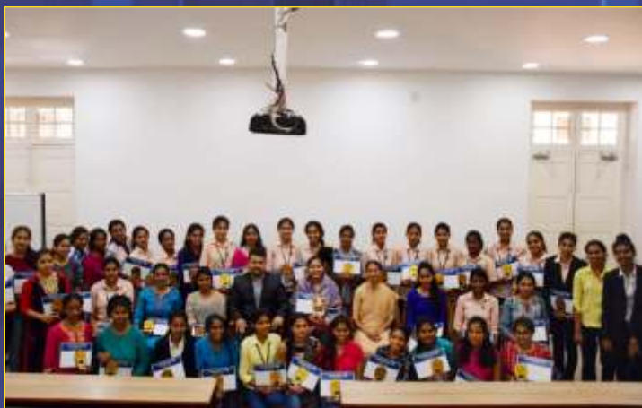
Training at St. Agnes College, Mangalore