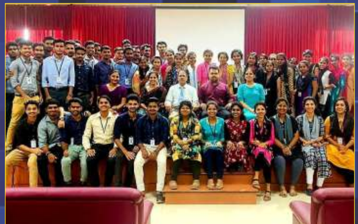
Training at A.J. MBA College, Mangalore