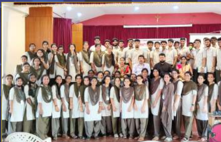
Training at St. Mary's College Shirva