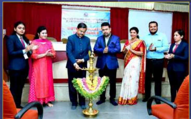
Guest at SDM College, Mangalore