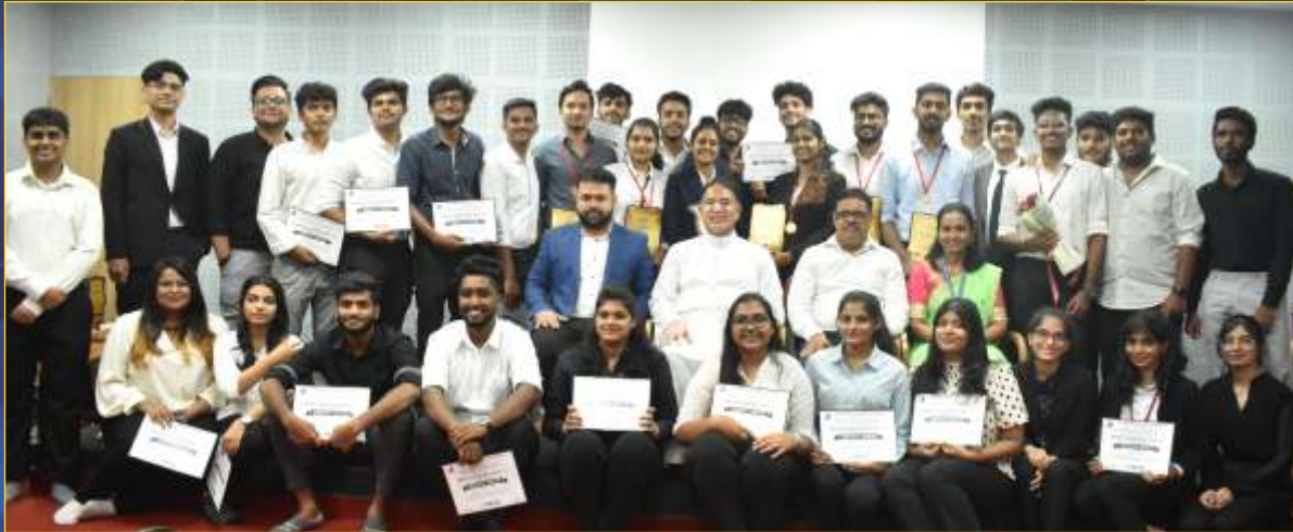
Achievers of St. Aloysius College, Mangalore